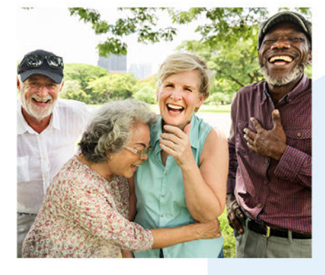
Better Affordability of high-quality medicines

This belief drives our curiosity and inspires us to continuously challenge the status quo. We love to pave new ways and to push frontiers to make a meaningful impact on patients' lives. By working together as one Tiefenbacher Group and building bridges across disciplines and diverse teams, we unlock our collective potential and continue to stay ahead. Our purpose has a deep and enduring value for us. It is our reason to come to work every day and reminds us why we exist as a company — to shape a healthier tomorrow.