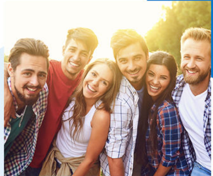
Better Availability throughout the world